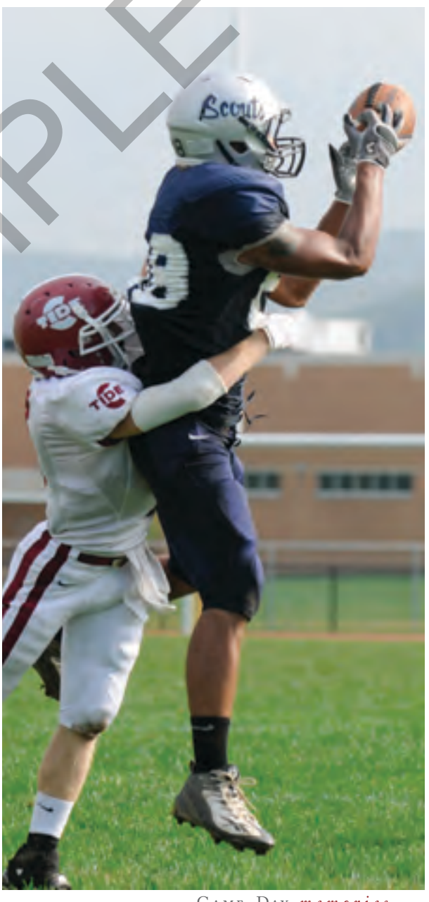
GAME DAY memories